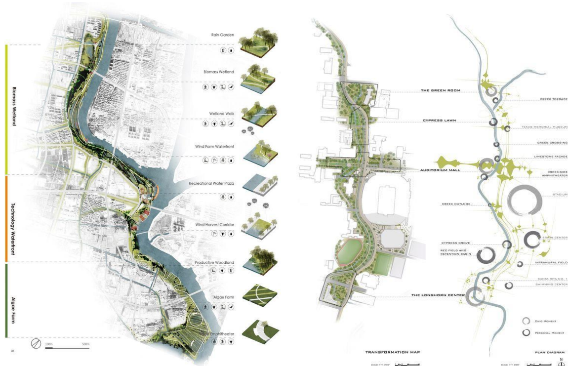
Figure 3. Proposals relevant to the scope of scientific research aimed at sustainable development.

When designing public centers, 10% of the total area of the centers should be allocated for special short-term parking spaces for cars.