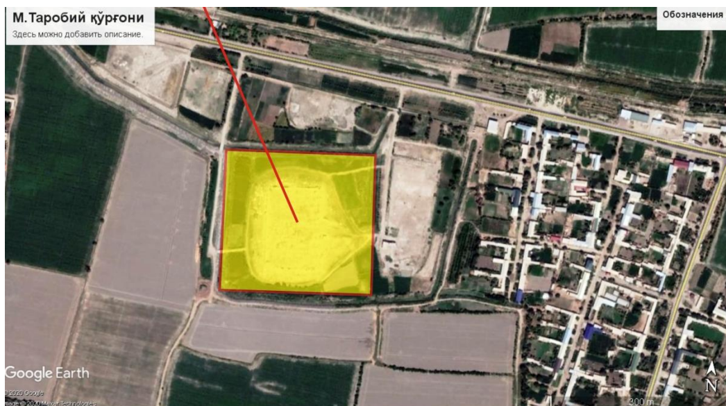
Figure 2. Aerial photo of Torob Tepa today.