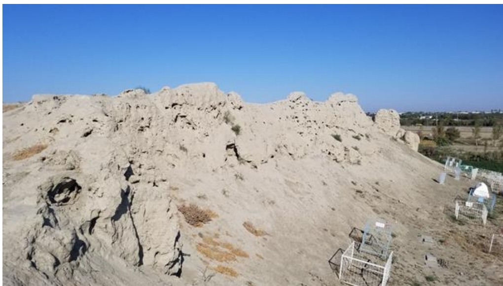
Figure 3. Remains of straw and raw brick wall at Torob Tepa. 2021 year.