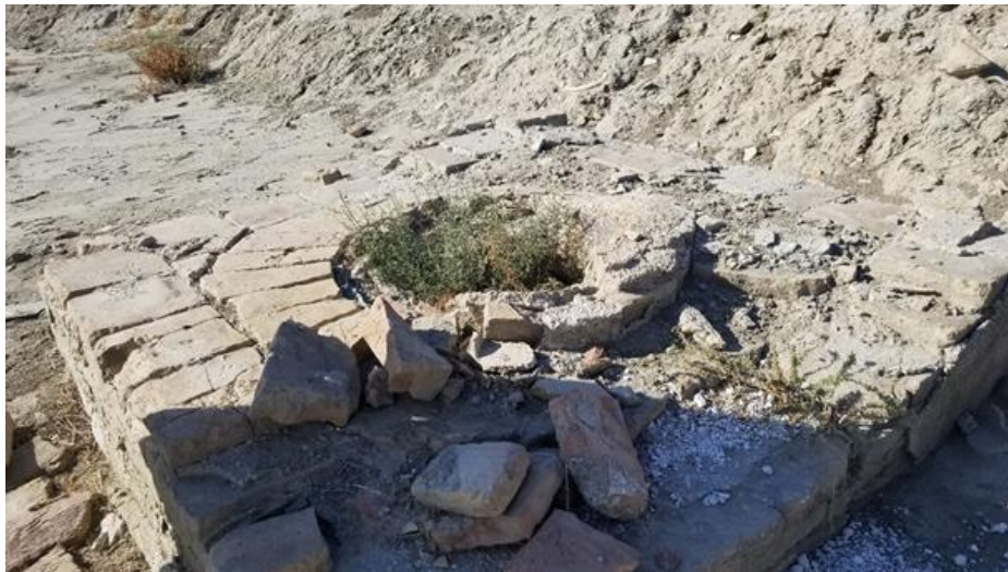
Figure 4. An old stone well at Torob Tepa. 2021 year

In the decision of the Cabinet of Ministers of the Republic of Uzbekistan No. 849 dated October 4, 2019 "On approval of the national list of immovable property objects of tangible cultural heritage", Torob fortress was registered as a cultural heritage object. This object is only registered, nothing else has been done and is not being done. [5]